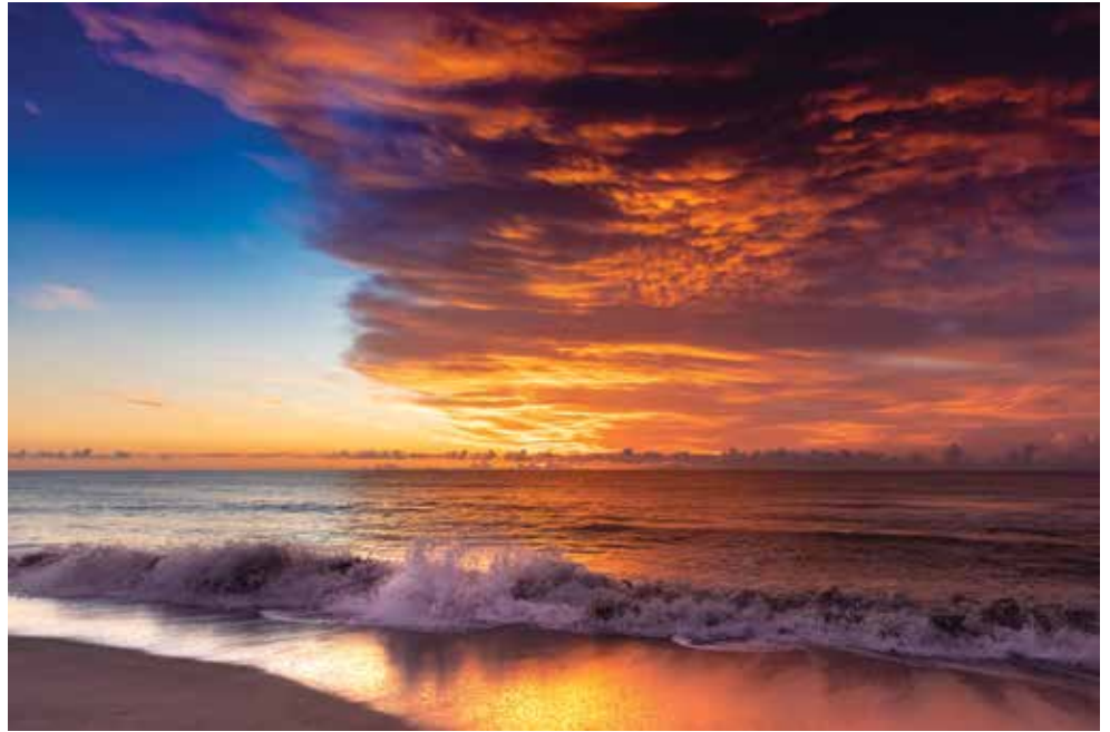
Sunrise at the Patrick Space Force Base. Florida Sky Colors in full bloom.