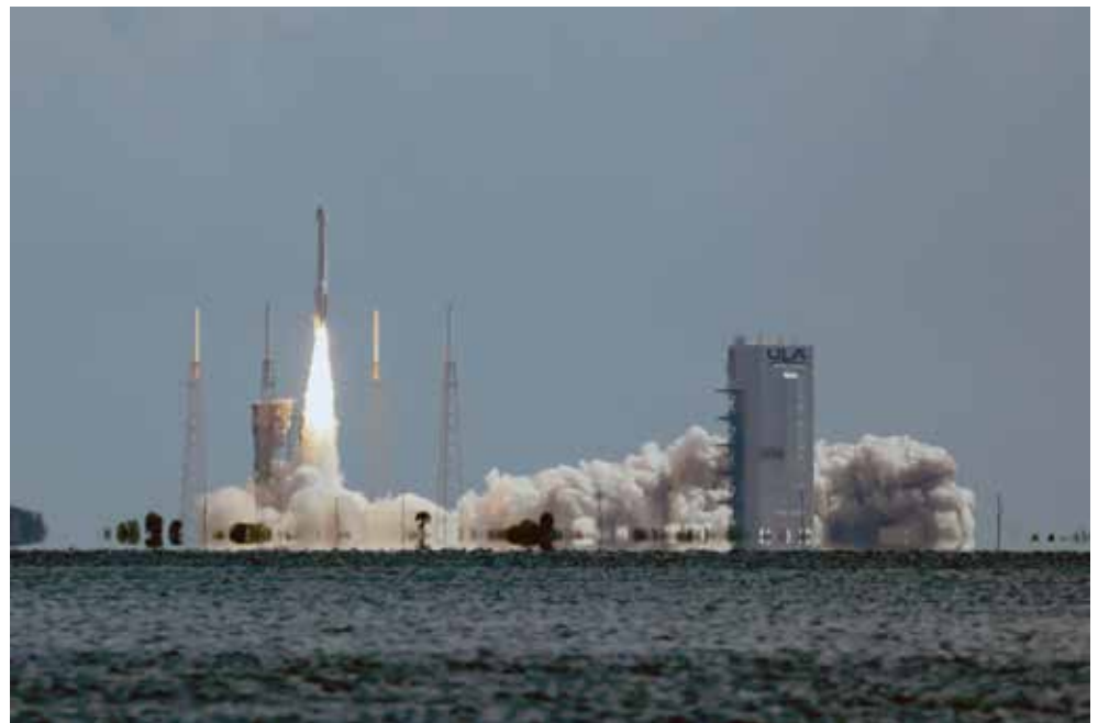
Long time coming: NASA,ULA, BOEING STARLINER launch headed for the Space Station last month.