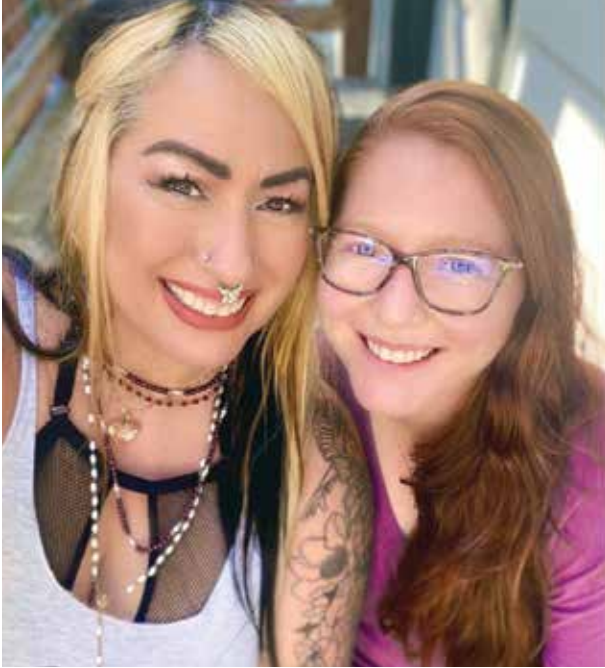
Fashionista • Boutique Owner • Designer